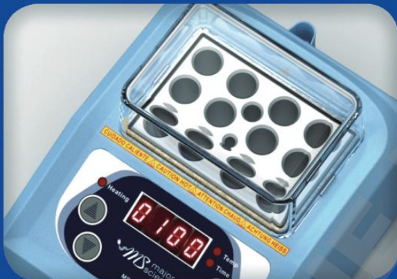
Clear cover to ensure temperature uniformity

The first of mini thermoblock product line, mini dry bath is finally here. It is compact in design yet powerful enough to fit all your incubating needs. Whether you need to incubate your PCR strips or use it as a water bath, the MD-MINI is up to the task. The molded PTFE coated chamber also allows you to use it as a water bath. The interchangeable ability of the heating block brings you the convenience of a traditional dry bath.