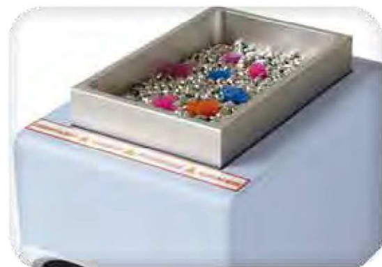
Can be used as a bead bath