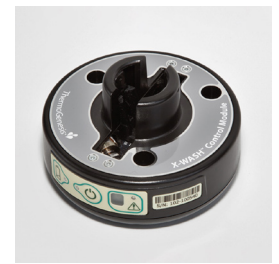
Corning X-WASH Control module