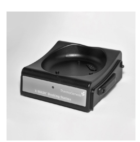
Corning X-WASH Docking station