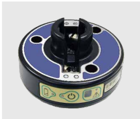
Corning X-LAB control module