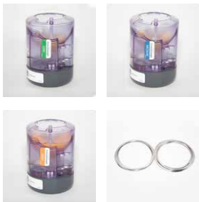
Corning X-Counterweights and Corning X-Balance ring kit