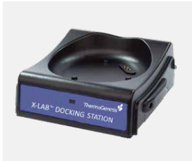
Corning X-LAB docking station