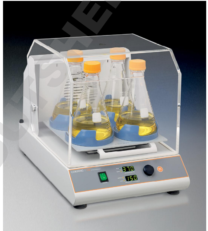
Corning LSE Benchtop Shaking Incubator

Corning LSE Shaking Incubators are the ideal solution to meet your small batch incubator needs. Whether performing bacterial research, microbiology, insect studies, yeast cultures, egg incubation, or any number of other applications, the shaking incubators from Corning provide a safe and convenient format for incubating your precious samples. Each model features an integrated orbital shaker designed into a compact footprint maximizing laboratory space. Additionally, a wide range of platform accessories are available to accommodate Corning glass and plastics consumables.