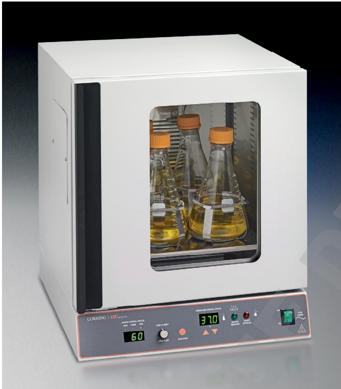
Corning LSE 49L and 71L Shaking Incubators (49L shown)