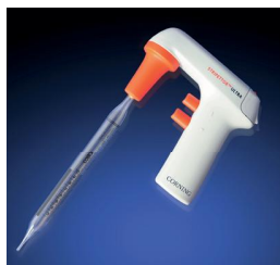
Shorty Stripette with pipet controller