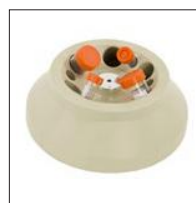
Combination rotor (Cat. No. 480143)