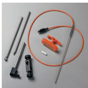
Digital hot plate accessories

When used with the digital hot plate or stirring hot plate, the external temperature controller ensures precision temperature accuracy of the liquid inside the vessel as opposed to the temperature of the hot plate top.