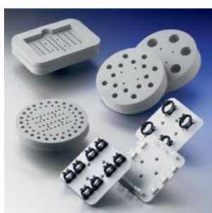
Accessory heads for Corning LSE vortex mixer