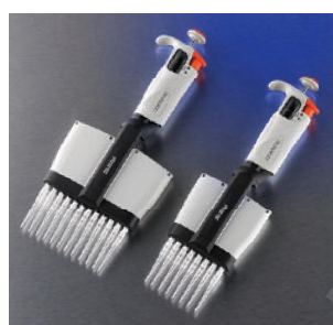
Corning Lambda Plus 8-channel and 12-channel pipettor