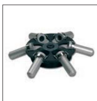
6 x 5 mL swing-out rotor (Cat. No. 480138)