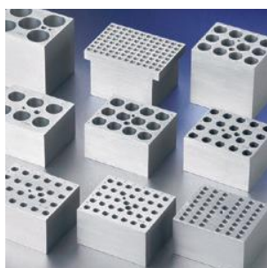
Digital dry bath heater accessories

A broad temperature range to 150°C makes Corning LSE digital dry bath heaters useful for a variety of applications in molecular biology, histology, clinical, environmental, and industrial laboratories. Models are available for one or two sample blocks, and a variety of blocks are available for different sample containers. Temperature is accurately controlled by a microprocessor and shown on a large 4-digit LED display.