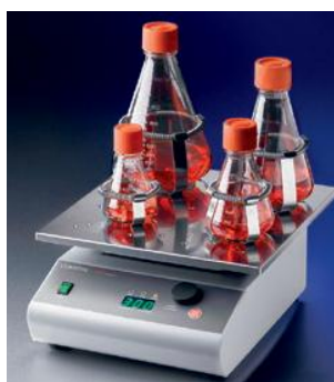
Orbital shaker with optional clamps and flasks