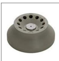
12 x 15 mL fixed angle rotor (Cat. No. 480137)