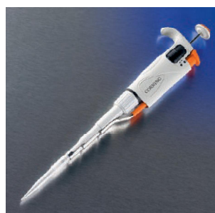
Corning Lambda Plus single-channel pipettor