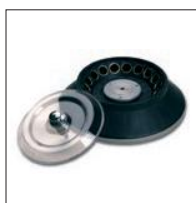
18 x 1.5 mL fixed angle rotor (Cat. No. 480139)