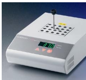
Single block digital dry bath heater