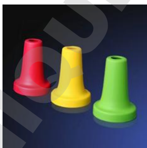
Extra nose pieces