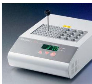
Double block digital dry bath heater