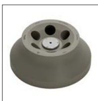
6 x 50 mL fixed angle rotor (Cat. No. 480136)