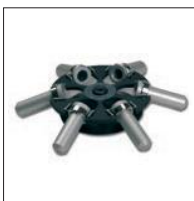
6 x 5 mL swing-out rotor (Cat. No. 480138)