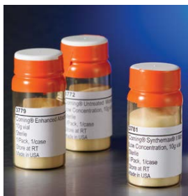
Corning Microcarriers, 10 g vials