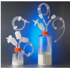
100 g and 500 g bottles with aseptic transfer caps

Corning Microcarriers simplify the scale-up process. The beads arrive sterile, ready-to-use, and are available with surface treatments to enhance cell attachment and maximize cell yield and viability. Closed systems packaging is also available for use with bioreactors.