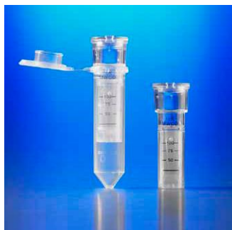
Spin-X UF 500

A size to fit all your concentrating needs