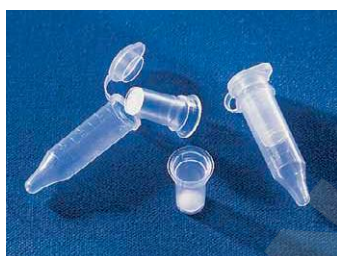
Corning Spin-X Centrifuge Tube Filters

Spin-X centrifuge tube filters consist of a membrane-containing (either cellulose acetate or nylon) filter unit within a polypropylene centrifuge tube. They filter small sample volumes by centrifugation for bacteria removal, particle removal, HPLC sample preparation, removal of cells from media and purification of DNA from agarose and polyacrylamide gels. (See Corning Technical Bulletin: Spin-X purification of DNA from agarose gels, page 6.)