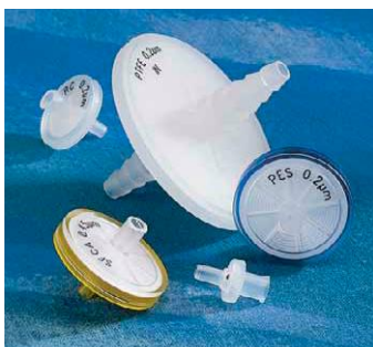
Corning Syringe Filters

The smaller conventional Corning ® syringe disc-type filters (4, 15, and 25, 26 and 28 mm diameter) are used with syringes which serves as both the fluid reservoir and the pressure source. They are 100% integrity tested. The HPLC-certified non-sterile syringe filters are available with nylon, regenerated cellulose or polytetrafluoroethylene (PTFE) membranes in polypropylene housing for extra chemical resistance. The sterile tissue culture tested syringe filters are available in PES, regenerated cellulose (ideal for use with DMSO-containing solutions), or surfactant-free cellulose acetate membranes in either polypropylene or acrylic copolymer housings.