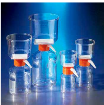
Corning Filter/Storage Systems

These sterile filters are available in three styles: complete filter/storage systems, bottle top filters and centrifuge tube top filters. Corning filters feature printed funnels that identify membrane type and product number for easy product identification. Angled hose connectors simplify vacuum line attachment. Four membranes are available to meet all of your filtration needs: cellulose acetate, cellulose nitrate, nylon, or polyethersulfone.