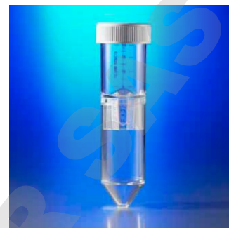
Spin-X UF 20