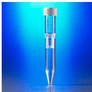
Spin-X UF 6