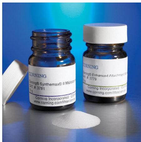
Corning Synthemax II and Enhanced Attachment Microcarriers in 10 g vials