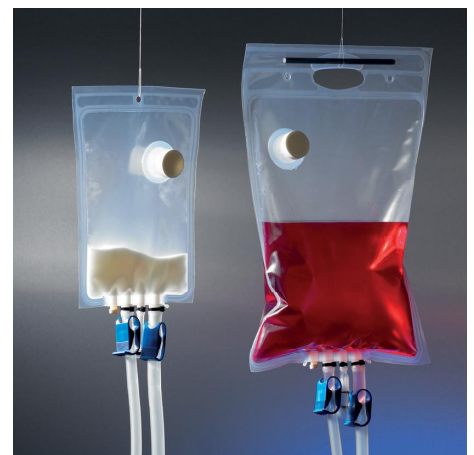
Closed system packaging for Corning Microcarriers