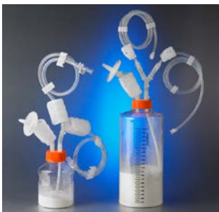
100 g and 500 g bottles with aseptic transfer caps

Corning Microcarriers simplify the scale-up process. The beads arrive sterile, ready-to-use, and are available with surface treatments to enhance cell attachment and maximize cell yield and viability. Closed systems packaging is also available for use with bioreactors.