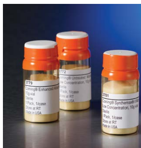
Corning Microcarriers, 10 g vials