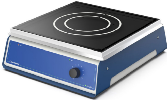
HP-200-IR-L 230V: 04807-84 120V: 04807-85