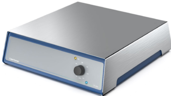
ST-200-L-S 230V: 04807-74 120V: 04807-75