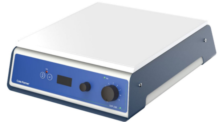
Hotplate Stirrer SHP-200D-L-C