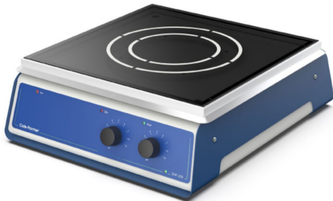
SHP-200-IR-L 230V: 04807-86 120V: 04807-87