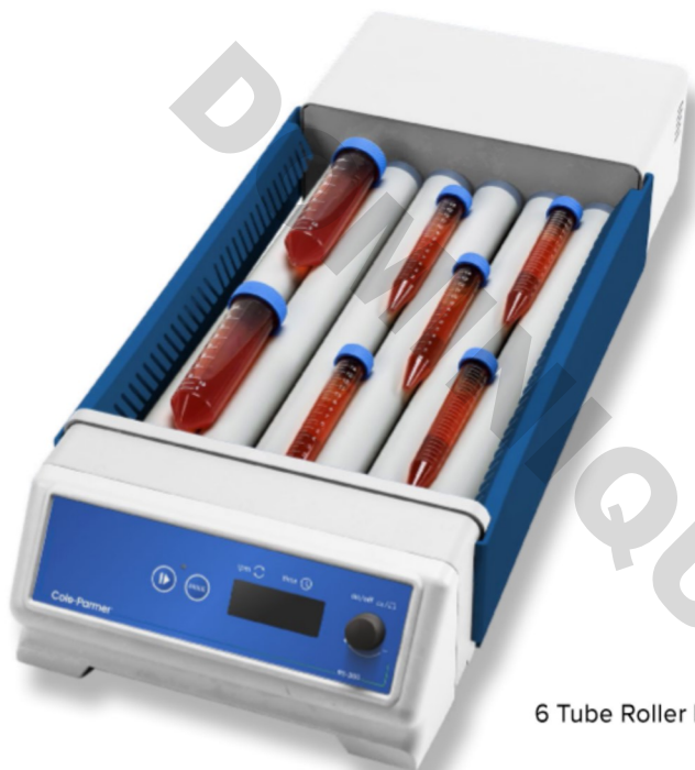
6 Tube Roller RS-200D