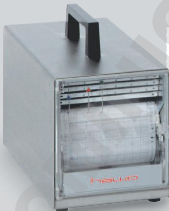
hm 455 C: 3-channel curve tracer