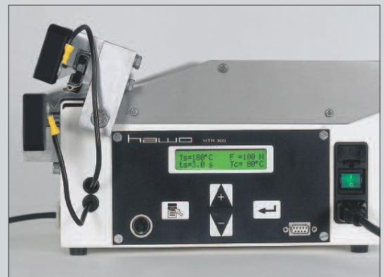
Laterally structured service elements with back-lit LCD display