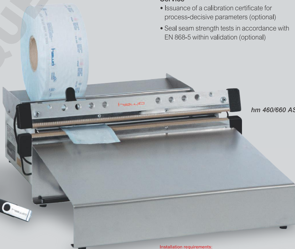
hm 460/660 AS-V

Installation requirements: The cross-section for the supply line of the outlet used must be a minimum of 2.5 mm 2 and be insured with security automatic circuit breaker 16A, characteristic curve K (G).