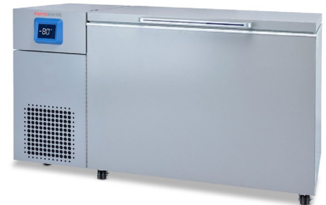
Figure 1. Thermo Scientific TDE Series ULT chest freezer.

phased out use of these refrigerants in our freezers and refrigerators in favor of using more environmentally friendly hydrocarbon alternatives. As an additional improvement, the foam insulation in TDE Series ULT chest freezers is now made from a material that has zero global warming potential and does not deplete ozone.