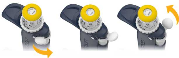
Adjustable Tip Ejector

Four PIPETMAN L multichannel models (product description ending with VR), covering a volume range from 20 \mu\text{L} to 300 \mu\text{L} , are equipped with V-rings at the bottom of the tip holders for a proper fit with most tip brands.