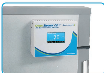
Touch Screen, remote controller adjusts shaker settings from outside of the chamber and magnetically attaches to most incubators